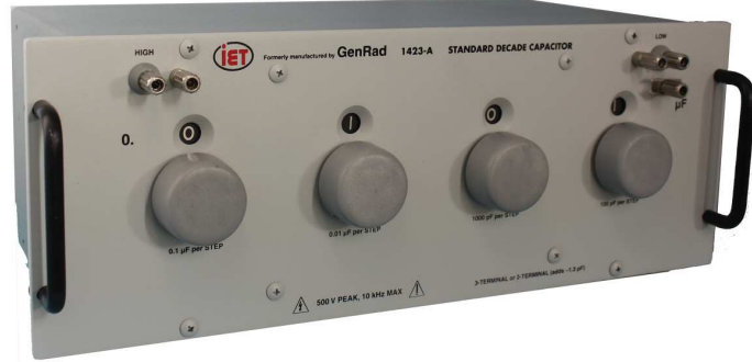
1423-A Decade Capacitor

Any value of capacitance from 100 pF to 1.111 \mu\text{F} in steps of 100 pF, can be set on the four decades and will be known to an accuracy of \pm 0.05\% , see specifications. The terminal capacitance values are set precisely to the nominal value and can be readjusted later at calibration intervals, if necessary, without disturbance of the main capacitors. The 1423 consists of four decades of high-quality silvered-