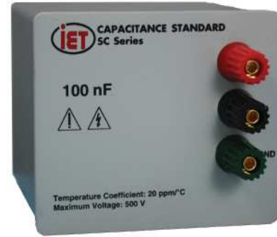
SCA Capacitance Standard