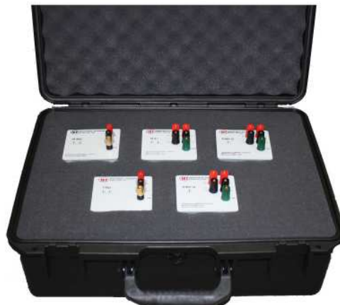
SRC-10-n Transit Case for n units (5 units shown)