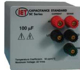
SCA-100μF (values > 1μF)