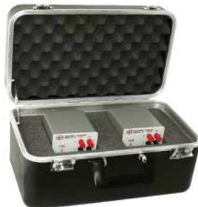
SRC-100 Transit Case for 2 units

changes during transportation or shipping. It is suitable for transporting and storing two or more units.