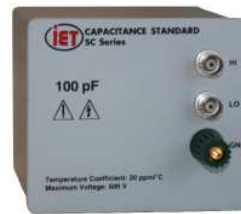
SCA-1nF (values ≤ 1.9 nF)