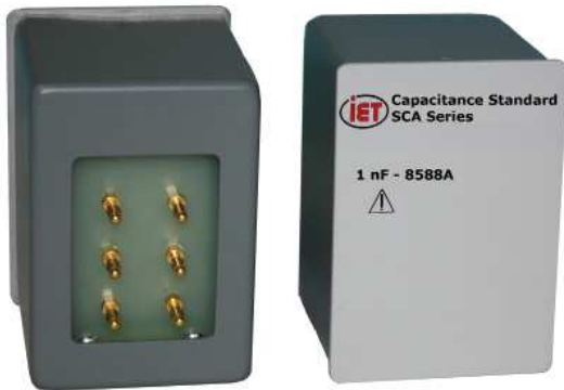
SCA-1nF-8588A Direct Connection