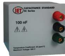
SCA-100nF (1.9 nF < values < 1μF)