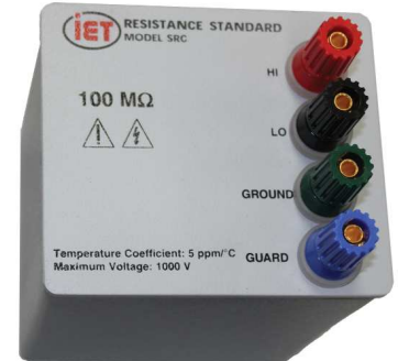
SRC Series Resistance Standard Two terminals with Kel-F Washers and Guard Terminal