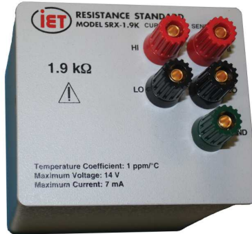
SRX Series Resistance Standard 190 kΩ and under

Designed for use as a reference or working standard in industrial, research, and educational laboratories.