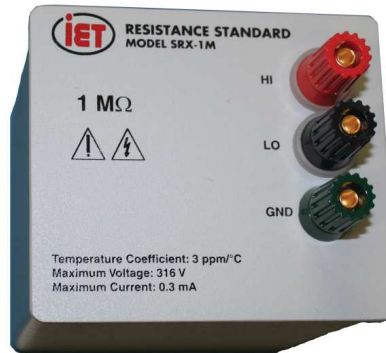
SRX Series Resistance Standard 1 MΩ and over