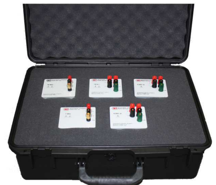
SRC-100-5 Lightweight transit case for 5 standards

Optional Model SRC-100-5 lightweight transit case with handle, suitable for transporting and storing 5 SRC/SRX resistance standards.